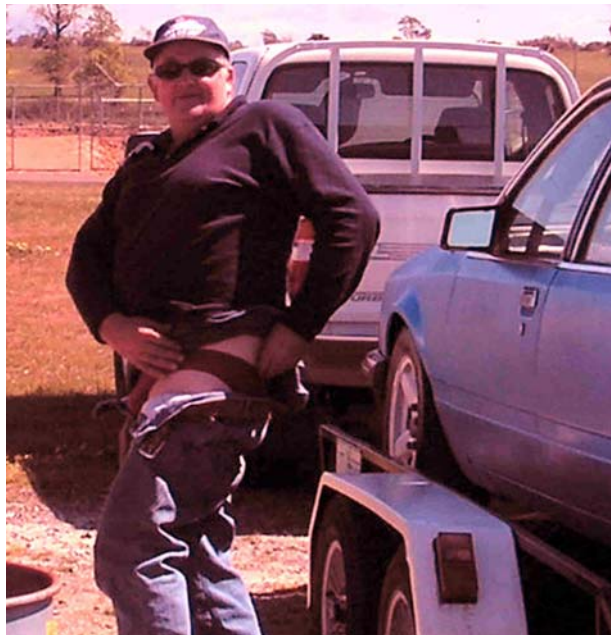
The man that wore red undies to make his car go faster but it didn't work did it?

Sunday 11 th December Hill Climb Legerwood Lane