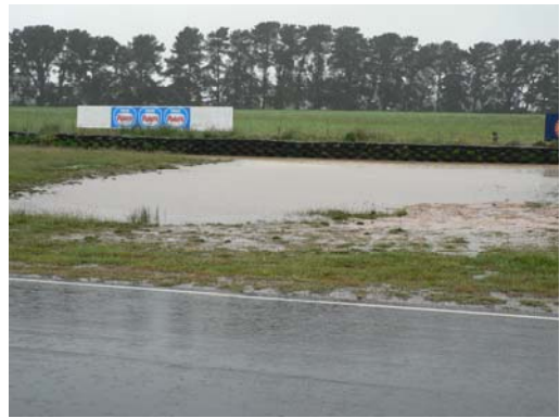
We had lakes alongside it!