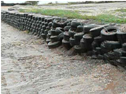
The tyre wall was washed out!