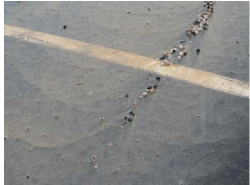
Even the gravel wanted to play!

Unfortunately, we had no other option than cancelling the event.