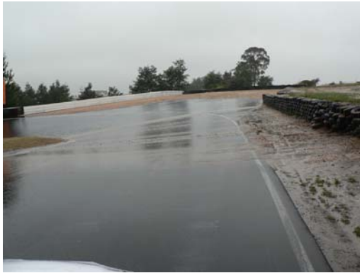
We had rivers across the track!

Rain, floods and wash outs. How else can you describe the conditions that welcomed us on Saturday morning at Symmons? Normally we don't get deterred by the rain, but this was more like a deluge.